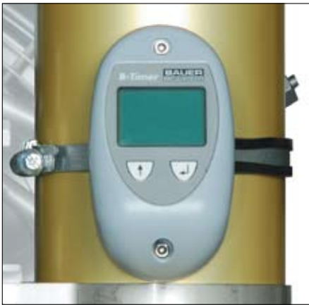
B-TIMER for filter monitoring