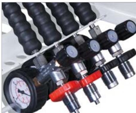
Corrosion free safety filling devices