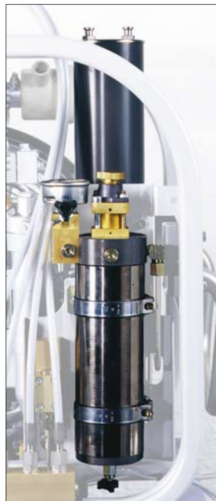
P41 filter system