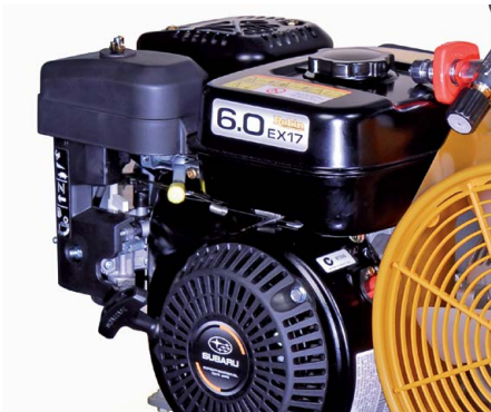
Unit variant with petrol drive