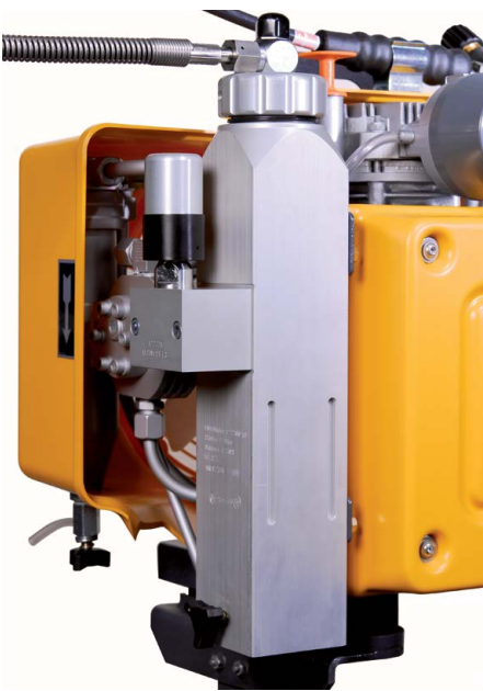
Purification system P 11 for pure breathing air